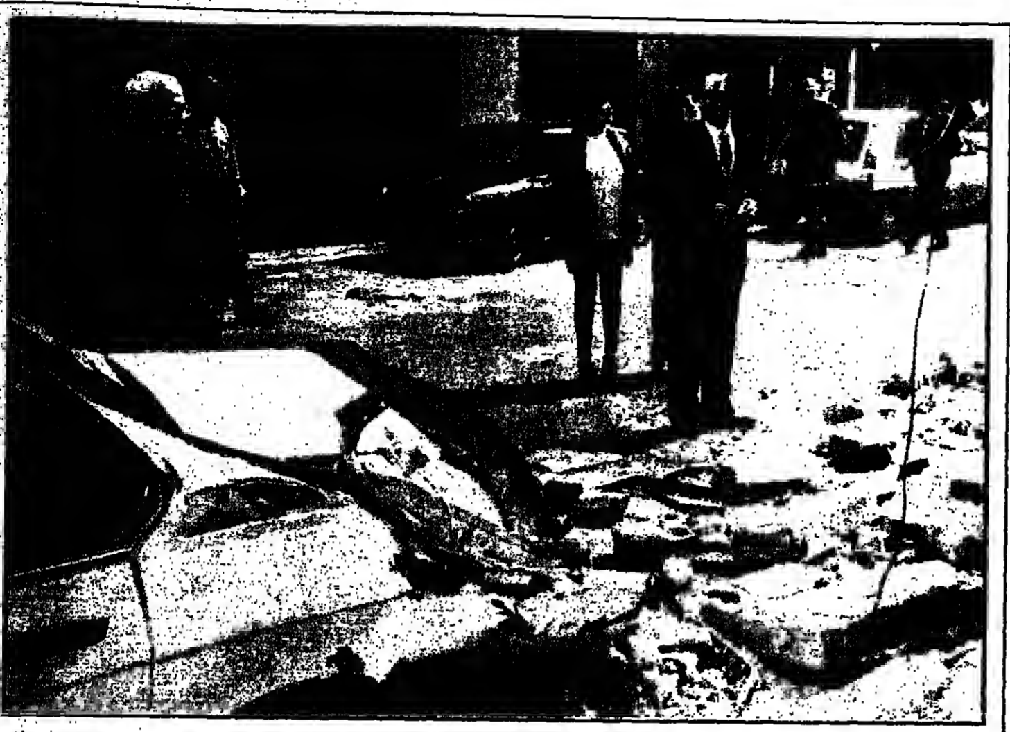
Earthquakes rumble region Beirutis inspect damage from an earthquake yesterday that could be felt in Lebanon, Israel and Syria. Story, Page 12.